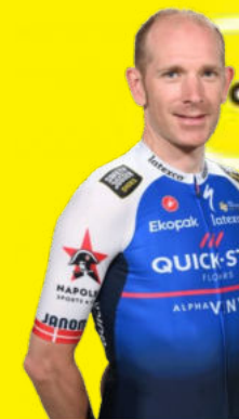
#57 MICHAEL MØRKØV QUICK-STEP ALPHA VINYL TEAM