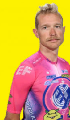
#146 MAGNUS CORT EF EDUCATION - EASYPOST