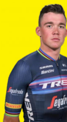
#171 MADP PEDERSEN TREK - SEGAFREDO