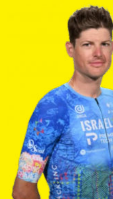
#194 JAKOB FUGLSANG UAE TEAM EMIRATES