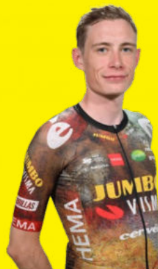
#18 JONAS VINGEGAARD JUMBO-VISMA