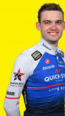
#52 KASPER ASGREEN QUICK-STEP ALPHA VINYL TEAM